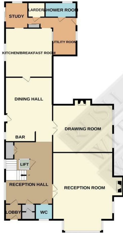
GROUND FLOOR 2185 sq.ft. (203.0 sq.m.) approx.