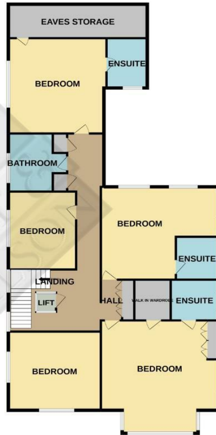
1ST FLOOR 2101 sq.ft. (195.2 sq.m.) approx.