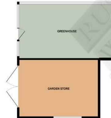
OUTBUILDINGS 557 sq.ft. (51.7 sq.m.) approx.