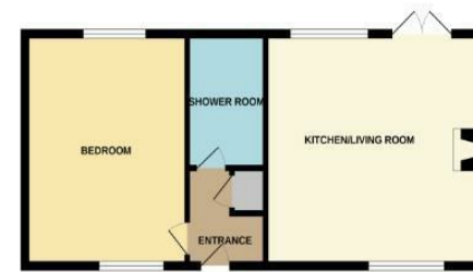
THE STABLES 455 sq.ft. (42.2 sq.m.) approx.