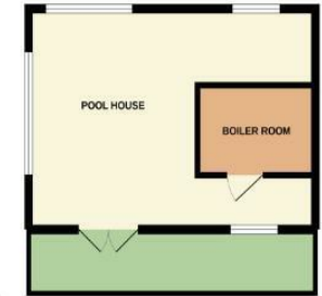
POOL HOUSE 274 sq.ft. (25.5 sq.m.) approx.